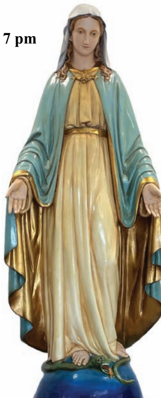
Our Lady of Grace, pray for us!