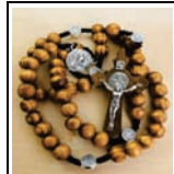
$5 – Wooden Rosary