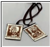
$5 - Scapular