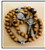
$5 - Scapular $5 – Wooden Rosary

“I am happy to die because I have lived my life without wasting a minute on those things which do not please God.” - Carlo Acutis