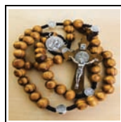
$5 – Wooden Rosary