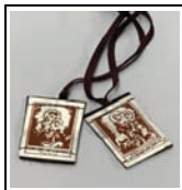
$5 - Scapular